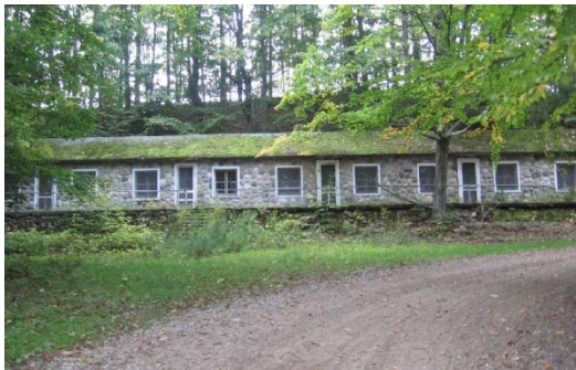
The old Echo Valley Resort Hotel

The site was the location of the Johannesburg Manufacturing Company for which the town was named after. The preserve currently allows hiking, biking, equestrian uses cross-country skiing and snowshoeing. In the future, plans include adding a nature center facility along with nature classes, horseback riding, sleigh/wagon rides, as well as rebuilding some of the historic structures that existed on the property.