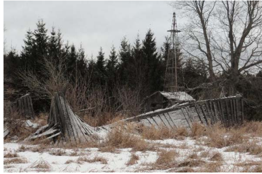
Remnants of sawmill lumberjack camp.